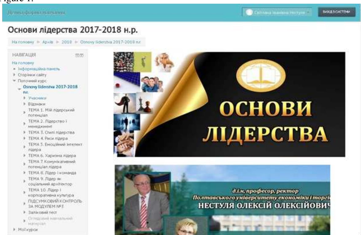
Fig. 1. The Home Page of the Distance Course "Fundamentals of Leadership"

The home page of the course "Fundamentals of Leadership" in Moodle is presented in Figure 1.