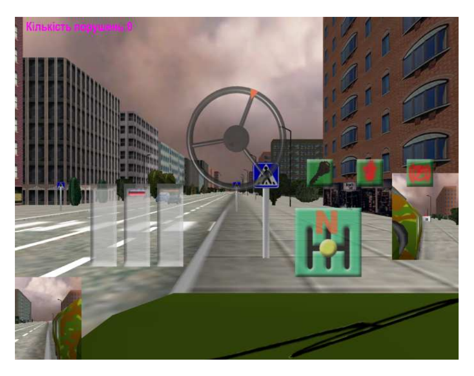
Fig. 3. User's window of the exercise

In general, while working with the simulator, two types of interfaces are used: the first one is used by the trainee – this interface should simulate the conditions of the DTS as precisely as possible (Fig. 3); the teacher (instructor) uses the other one when setting up a training complex (Fig. 4).