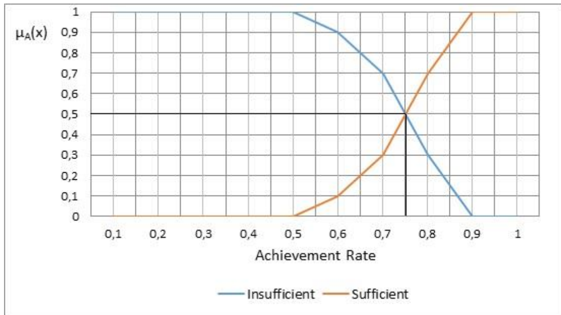
Fig.1. Membership functions curves

The numerical value of the achievement rate by which the membership functions of the terms “sufficient” and “insufficient” take the same values is chosen to be the minimal sufficient achievement rate. As can be seen from Fig. 1, 0,75, ( \mu_1(0,75) = \mu_2(0,75) = 0,5 ) is accepted for such a value.